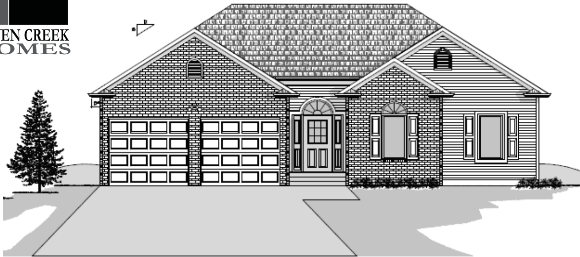
The Stonefish Floor Plan 1608 sf